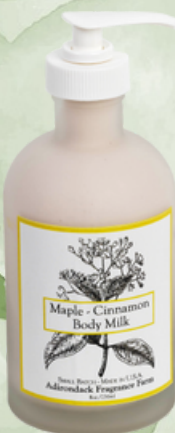
Maple - Cinnamon

#FA4027001-8 - 8 oz frosted glass Price: $28