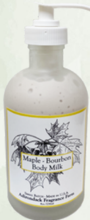
Maple - Bourbon

#FA4027001-8 - 8 oz frosted glass Price: $28