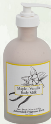
Maple - Vanilla

#FA4026001-8 - 8 oz frosted glass Price: $28