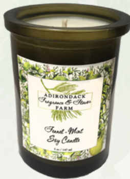
Fennel Mint Candle