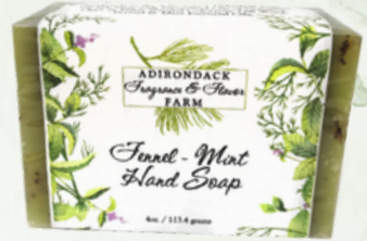
Fennel Mint Hand Soap