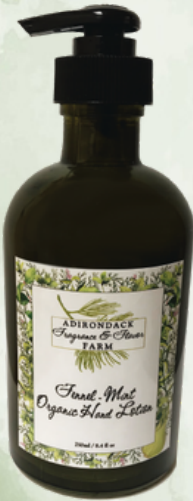
Fennel Mint Hand Lotion